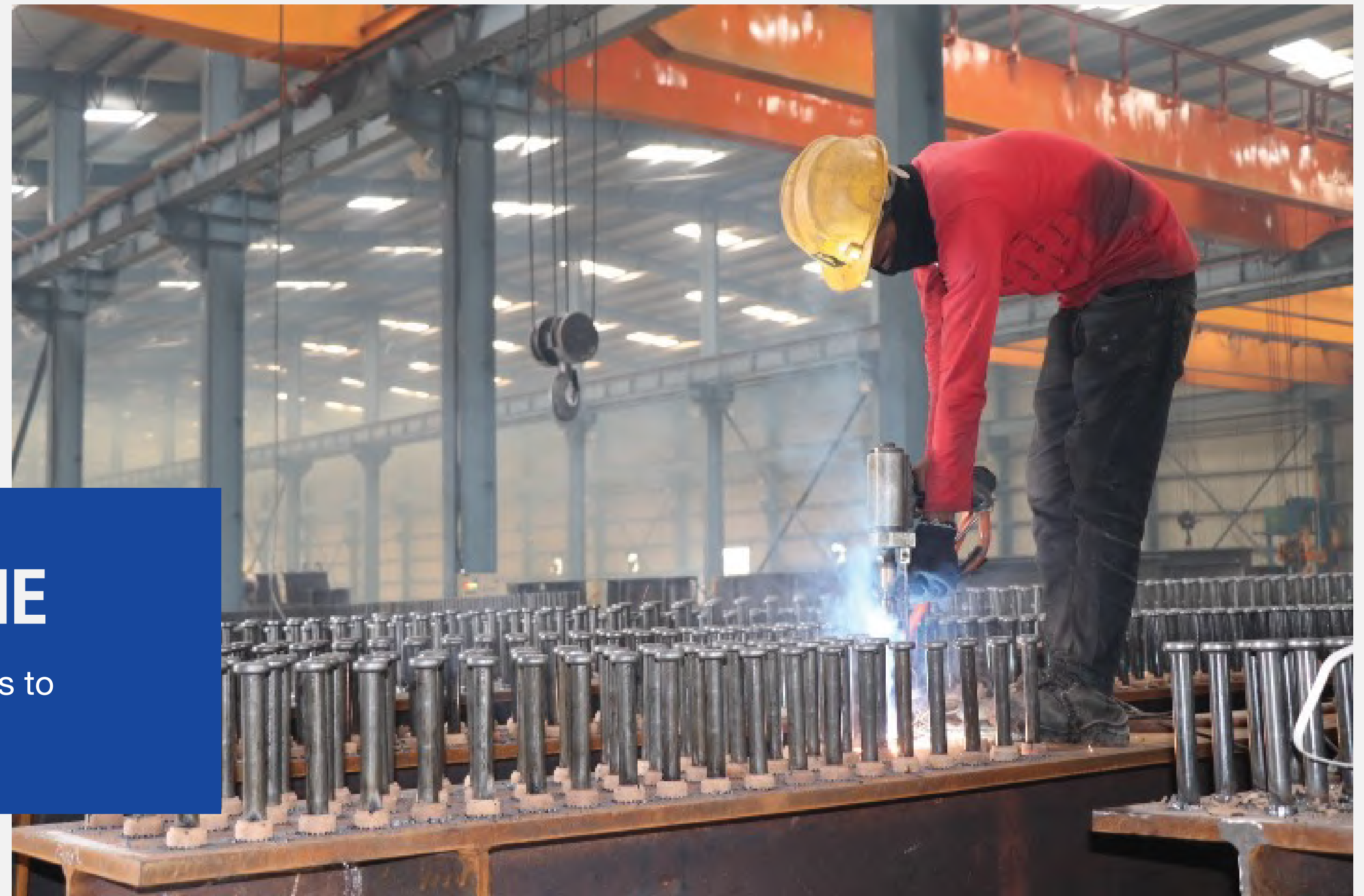
STUD WELDING IN PROGRESS OF 25MM X 205MM FOR RAILWAY GIRDERS

We are equipped with 3 stud welding machines to meet our production schedules.